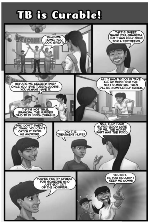
Health Canada, "TB is Curable," http://www.hc-sc.gc.ca/fniah-spnia/alt_formats/pdfpubs/disease-maladies/tuberculosis/tb_booklet_fn_eng.pdf (accessed August 04, 2011).