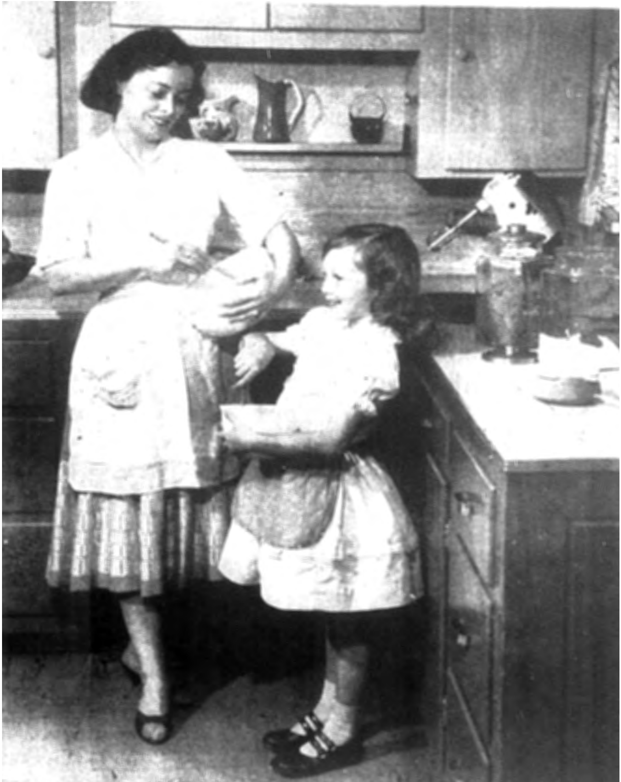
Figure 4: "The Daily Nugget Cook Book," North Bay Nugget , 25 February 1958. Printed with permission of the North Bay Nugget .