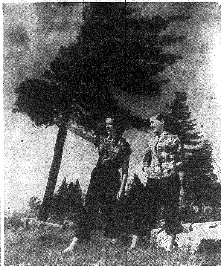
Wholesome Youth and the Great Outdoors