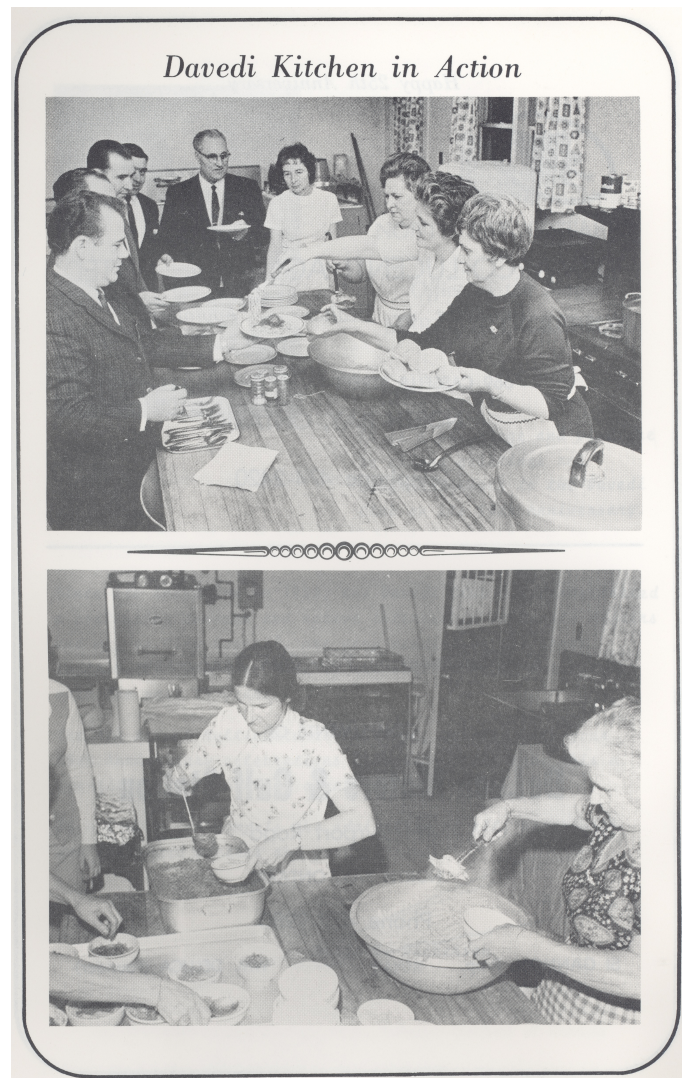
Figure 6: “Davedi Kitchen in Action,” “Davedi Club, North Bay Ontario: The First 25 Years, 1953-1978,” Institute for Community Studies and Oral History, Nipissing University, North Bay, Ontario, p. 19.

Printed with permission of The Ladies Auxiliary, Davedi Club, North Bay, Ontario.