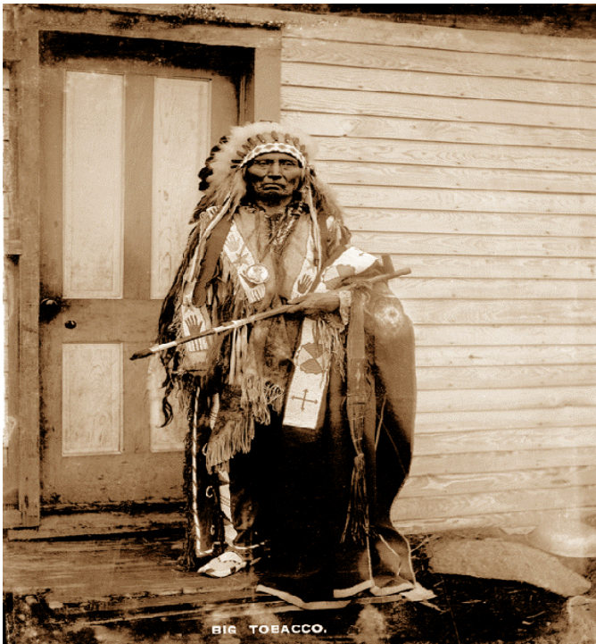
Illustration 1. “Big Tobacco” Dance Hall Chief circa 1900 (U.S. Geological Survey Department of the Interior, 2010).

The photo of Dance Hall Chief “Big Tobacco” (circa 1900) shown in Illustration 1 is a typical depiction of the significant role that tobacco has had in the lives of many Aboriginal people (in this case American Indian).