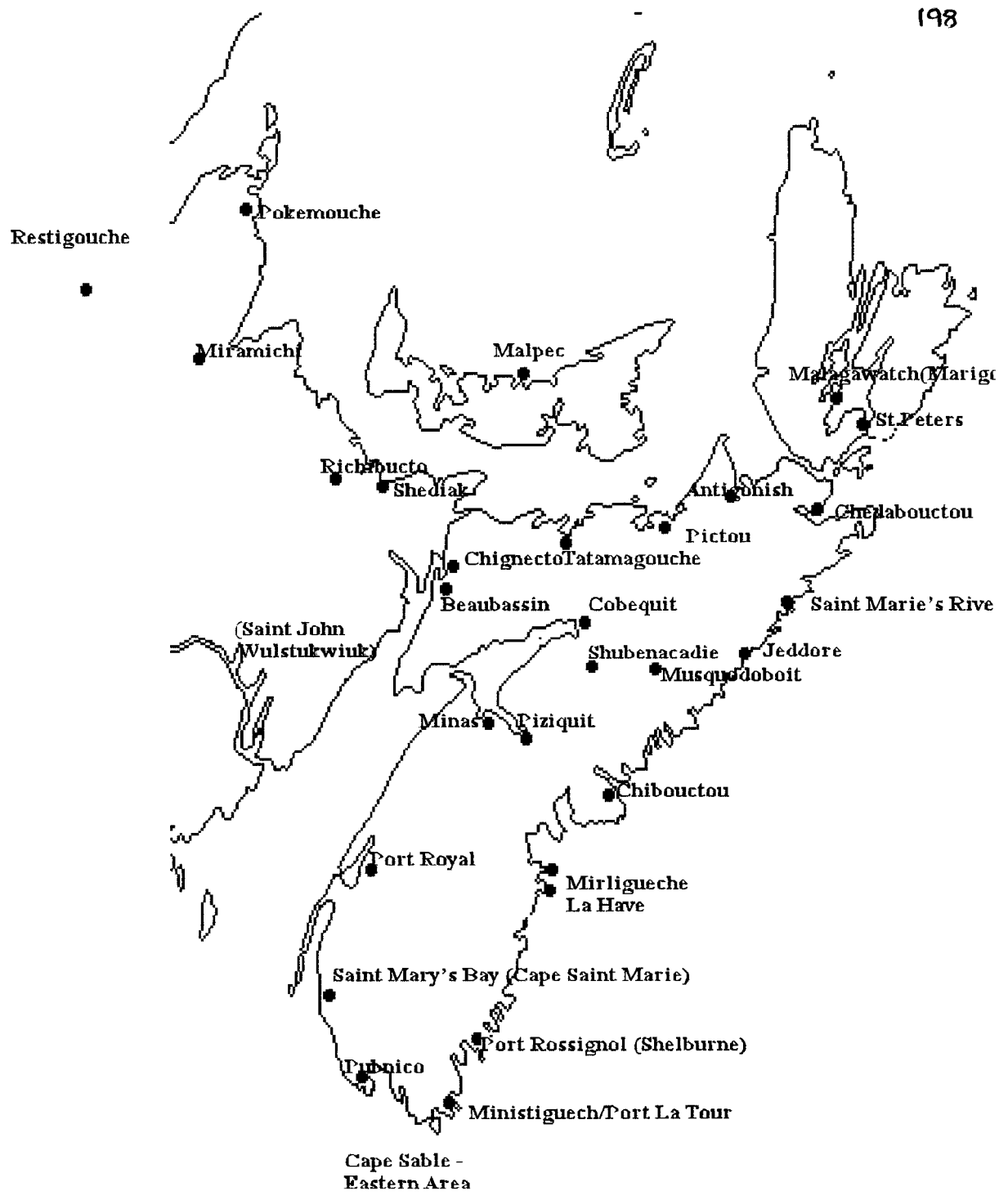
Figure 1: Mi'kmaq Communities Identified in the Censuses of 1688, 1708, 1722, 1735, 1737 and the Treaties of 1726, 1760 and 1761